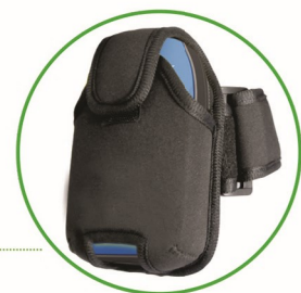
Hands free design