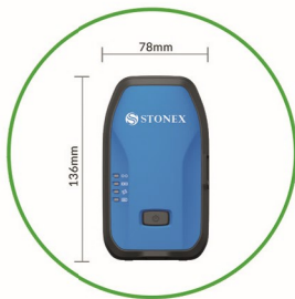
High precision positioning in a small space

Precision Farming, Mapping, GIS data collection, environmental agencies, fotogrammetry by UAV, forestry are just a short list of the fields where Stonex S580 will give a decisive impulse to the productivity and to the quality of the positioning data; with the ability to use the already existing devices, as Smartphones and Tablet with Android and Windows operating system.